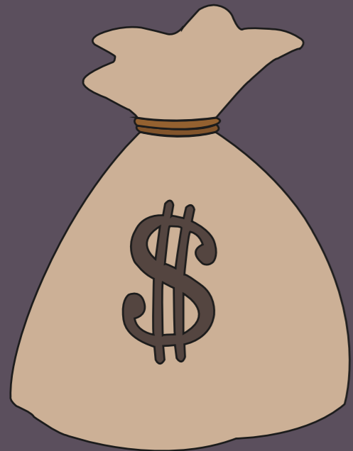
Bag of Cash

the Bag of Cash is a main principle in the game Capture as the aim is to capture that bag of cash from the other team which is placed in a landmark somewhere in London and it is the teams job to find this bag of cash. when you get the bag of cash you win the game and get more points helping you to level up and get